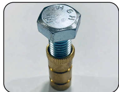
5/8-11 Bolt 1" Long not threading in