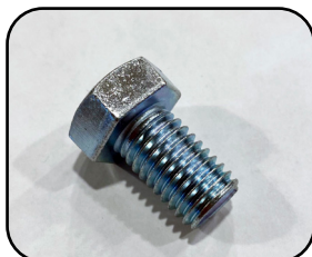
5/8-11 Bolt 1" Long Picture above

Go to your local hardware store (Home Depot..ect) and purchase a 5/8-11 bolt at least an "1 long. Try and screw this into your existing anchor socket, if it screws in you need to order the 5/8-11 size. If it DOES NOT then you need to purchase the 9/16-12 size